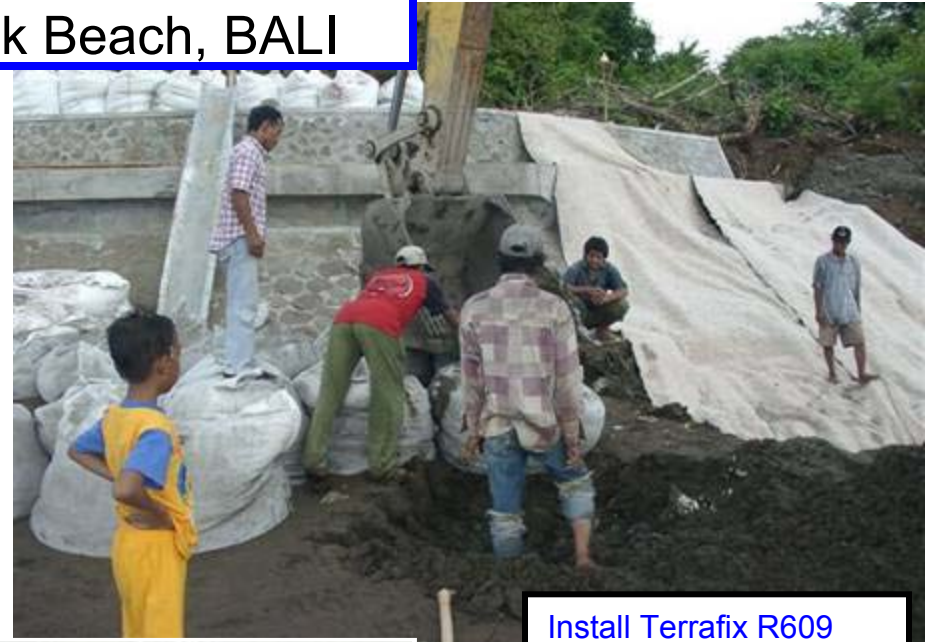
Install Terrafix R609