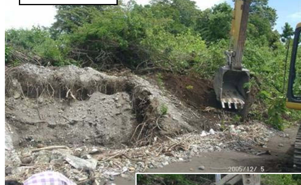
Existing condition, before installation