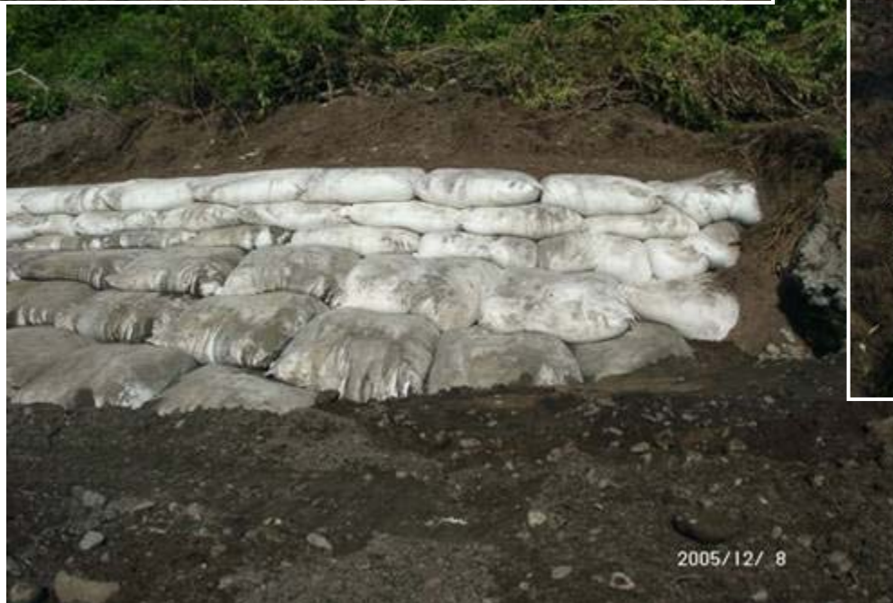
Segara Rupek Temple Protection, Jembrana - BALI